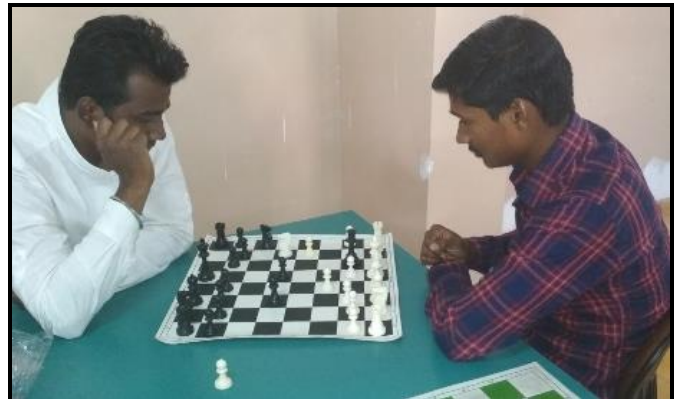
Match in Progress