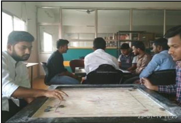
Carrom Single Competition Semi Final