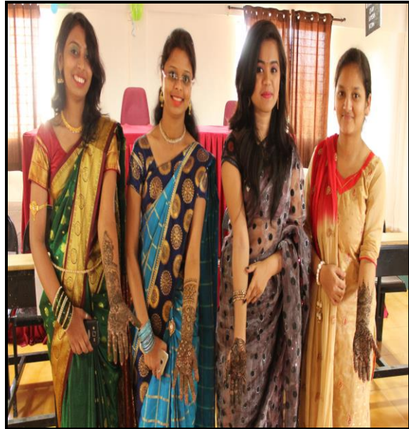
Participants depicting Mehendi at the competition