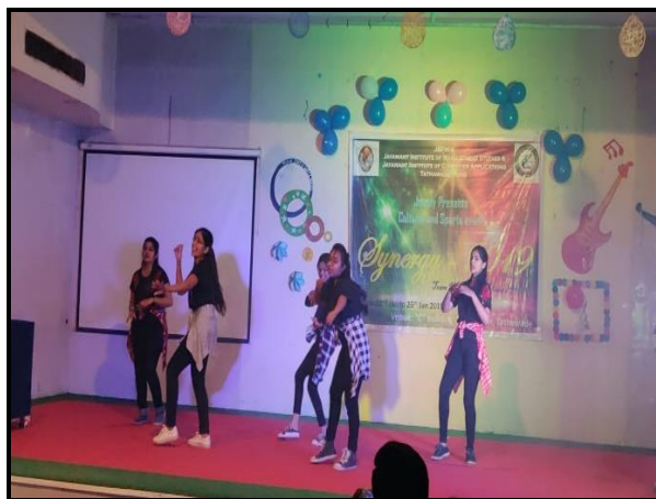
Winner of group dance