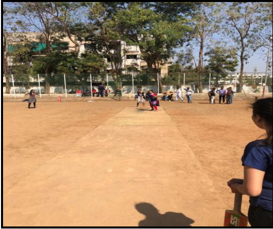
Girls cricket team