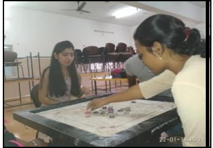
Carrom Single Competition(Girls)